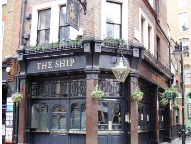
(The Ship, Wardour Street, Soho.)

From Thursday January 2 nd – Monday January 20 th